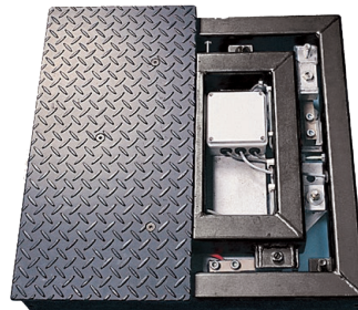
Cross section of the double frame with a ball mounted floating deck for impact protection.