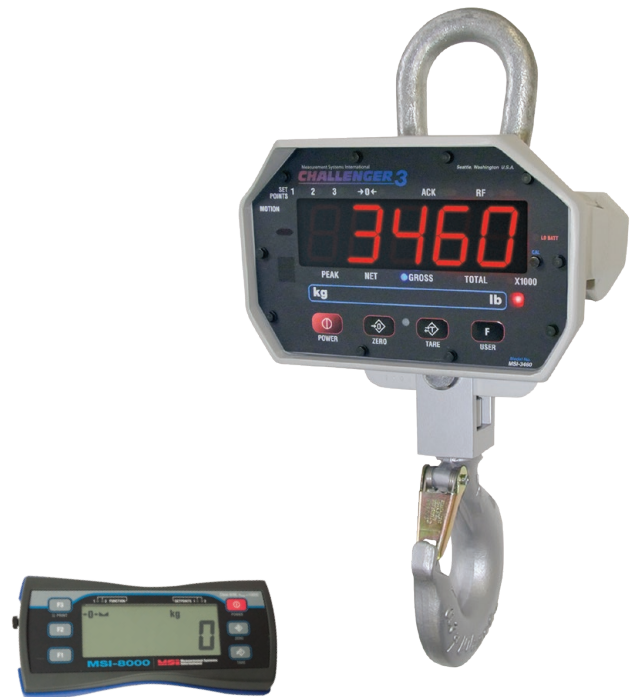
WIRELESS REMOTE DISPLAY